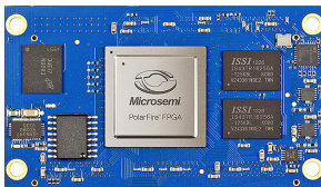
Image 1: ARIES Embedded integrates Microchip's PolarFire FPGA in M100PF system-on-module for industrial and medical technology